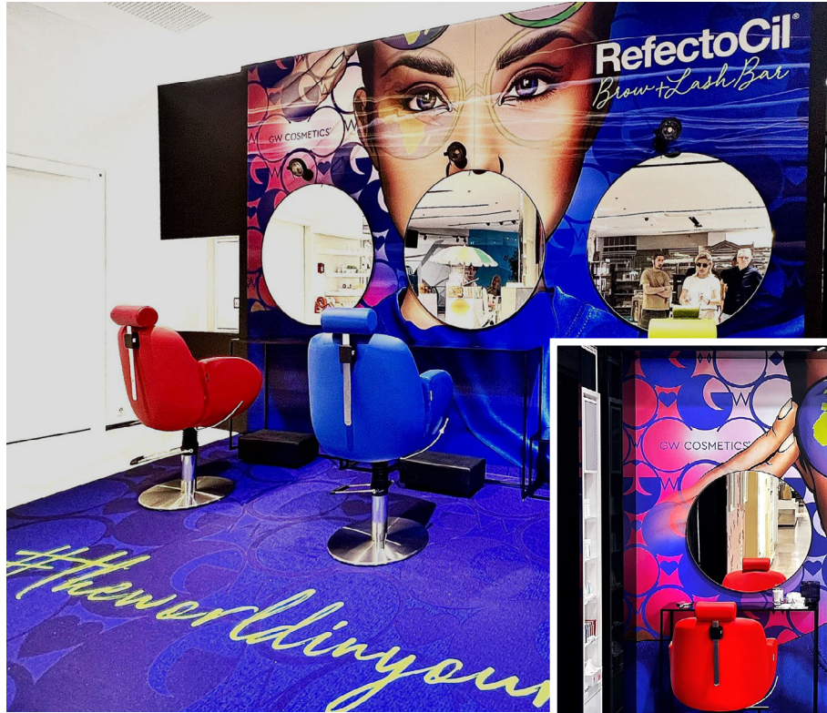
STEFFL DEPARTMENT STORE VIENNA